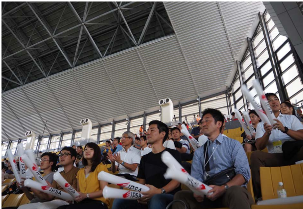
Interested Employees Gathered to Watch a Competition

Moreover, we acquired the naming rights to the Shin-Toyosu Brillia Running Stadium track and field facility that opened in December 2016 and cooperate in operating the facility. The Shin-Toyosu Brillia Running Stadium combines an artificial sports leg development laboratory where people with disabilities can train side-by-side with everyone else.