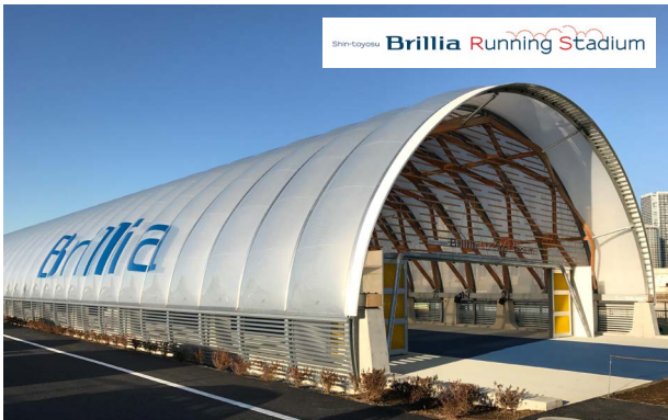
Shin-Toyosu Brillia Running Stadium