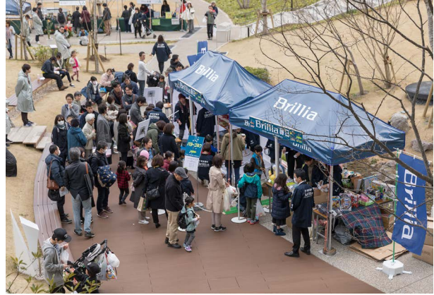
The Tokyo Tatemono booth at the Meguro Hanabusayama Foresta 2018 offered a ring toss for both adults and children to enjoy.

Tokyo Square Garden has regularly held the Kyobashi Market since August 2018 to sell fresh vegetables and processed foods by using the 1F connecting corridor. Brillia Towers Meguro redevelopment association proposed and held the Meguro Hanabusayama Foresta 2018 as an event to celebrate the new town. The Tokyo Tatemono Group also acted as a founding sponsor and opened a booth.