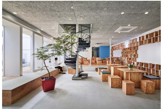
Inside Loco-café "oooi"

The on-site model room for Brillia Shinagawa Minamioi that opened in October 2018 set up the Loco-café "oooi" as a community gathering place everyone in the neighborhood may use inside a sales center before construction began on the condominium with the hope of quickly developing a community in the region for everyone who planned to buy one of the units. The café added a contact point with everyone from the local community. We also held other events to encourage interaction with everyone who planned to buy a unit at Brillia Shinagawa Minamioi in addition to renting a gathering space for the local community. These efforts supported the smooth and rapid development of a community for everyone who planned to buy one of these Brillia units by encouraging interaction with the local community.