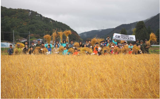
Participants of harvesting rice

The Tokyo Tatemono Group aims to build an affluent society through reconstruction after the Great East Japan Earthquake and interaction between the city and farming villages, and it supports rice planting activities for the local Teneimai rice from Ten-ei village in Fukushima Prefecture. Hatoriko Highland Regina Forest Co., Ltd. owned by Tokyo Tatemono Group up until 2016 was located on the outskirts of Ten-ei Village, which began support and other activities with roughly 100 employee volunteers participating. Employees and their families experience farming such as the rice-planting in spring, cutting weeds in summer, and the harvest in fall while interacting with the local farmers. The company and these individuals are unified in deepening their understanding of Ten-ei Village and supporting the reconstruction of Fukushima from Ten-ei Village through these activities.