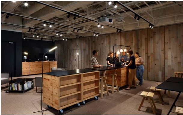
City Lab Tokyo Co-working Space

More Information About City Lab Tokyo Official website: https://citylabtokyo.jp/ Official Facebook page https://ja-jp.facebook.com/citylabtokyo/