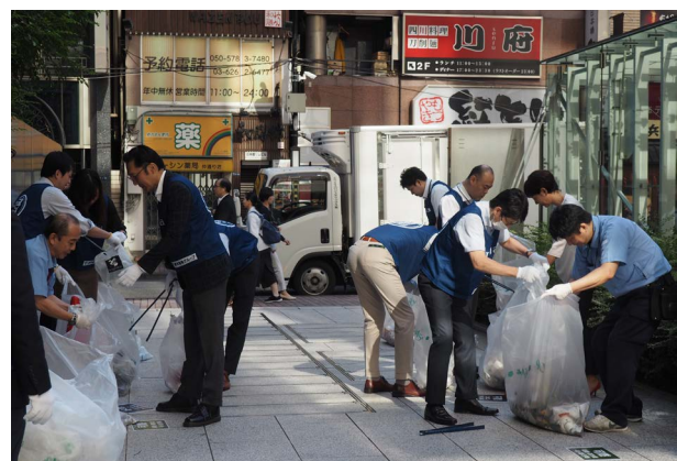
Morning Cleaning Activities

The Tokyo Tatemono Group is regularly conducting cleanup activities by using time such as that before the start of work for urban beatification in multiple areas that include Yaesu where our the Tokyo Tatemono head office is located, Nihonbashi, and Kyobashi. These activities have been praised and received a letter of appreciation from the Nihonbashi Clean Business Cooperative.