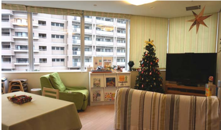
Common Room for Two Families to Spend Leisure Time

*A certified non-profit organization (NPO) is an organization that receives tax incentives to encourage donations to the organization. NPOs can only be established through the certification system, but the organization must have a certain activity periods and needs to pass an evaluation by a competent authority.