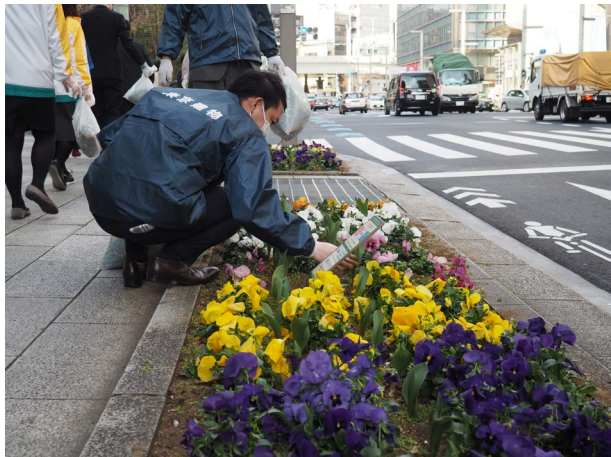
Replanting Flower Beds Along Chuo-dori

Tokyo Tatemono helps take care of flower beds of sidewalks along Chuo-dori as a member of the NPO Hana Kaido. We also work with the Cheering Supporters for the Woods of "Chuo City" to help use the trimmings from the woods in the Chuo Ward at other sites of their activities. We produced planter filler from the trimmings while contributing to the beautification of the city, such as setting up roughly 100 flower beds on sidewalks around construction sites through the NPO Hana Kaido.