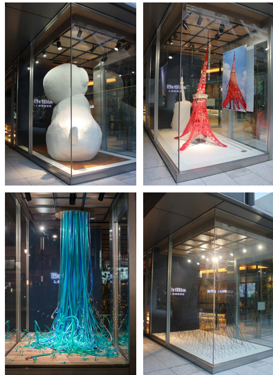
Works by Artists Introduced in 2018

For more information about THE GALLERY in Brillia LOUNGE and Brillia ART AWARD, see: https://brillia.com/brillia/topics/ https://www.brillia.com/artaward/index.html