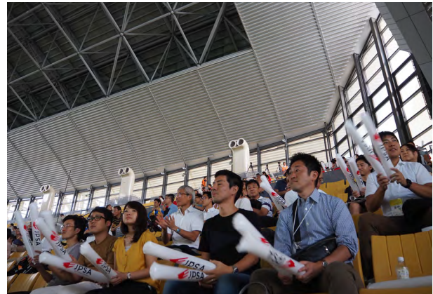
Interested Employees Gathered to Watch a Competition

Moreover, we acquired the naming rights to the Shin-Toyosu Brillia Running Stadium track and field facility that opened in December 2016 and cooperate in operating the facility. The Shin-Toyosu Brillia Running Stadium combines an artificial sports leg development laboratory where people with disabilities can train side-by-side with everyone else.