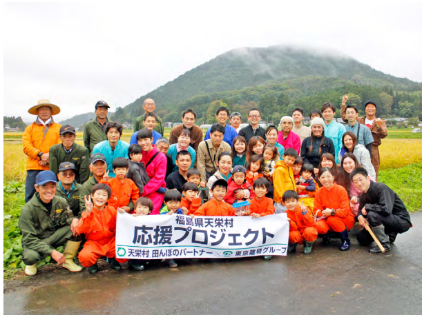
Participants of harvesting rice

The Tokyo Tatemono Group aims to build an affluent society through reconstruction after the Great East Japan Earthquake and interaction between the city and farming villages, and it supports rice planting activities for the local Teneimai rice from Ten-ei village in Fukushima Prefecture. Hatoriko Highland Regina Forest Co., Ltd. owned by Tokyo Tatemono Group up until 2016 was located on the outskirts of Ten-ei Village, which began support and other activities with roughly 100 employee volunteers participating. Employees and their families experience farming such as the rice-planting in spring, cutting weeds in summer, and the harvest in fall while interacting with the local farmers. The company and these individuals are unified in deepening their understanding of Ten-ei Village and supporting the reconstruction of Fukushima from Ten-ei Village through these activities.