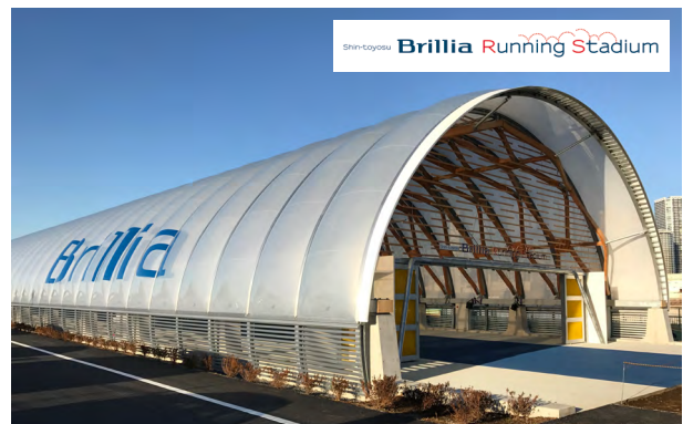
Shin-Toyosu Brillia Running Stadium