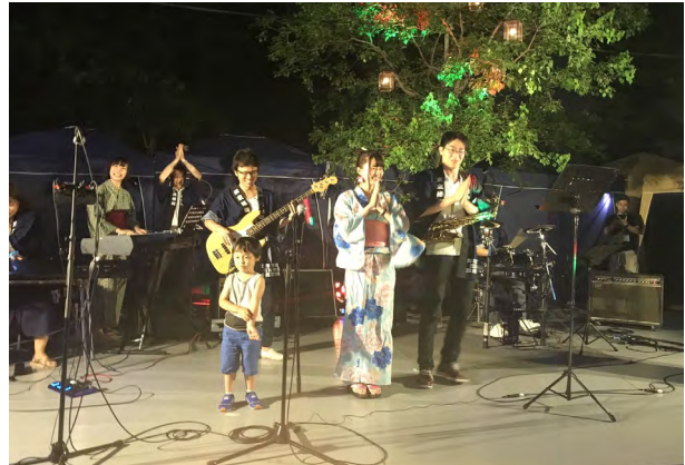
The music club from the Tokyo Tatemono Group also performed on stage at the Nakano Summer Festival

Award in the Creation of Town, Local Area or Community category in 2014.