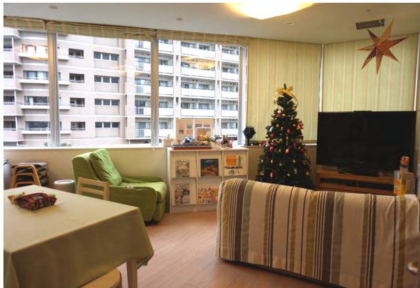
Common Room for Two Families to Spend Leisure Time

Apartments Tower Kachidoki rental condominiums owned by Tokyo Tatemono has concepts to both support the raising of children and to co-exist with the community. The building provides facilities such as certified childcare, family house, pediatric clinic, and residence for a generation raising children. The family house, which is operated by the NPO Family House*, is a second home to use as a residence facility for families that travel to urban hospitals from afar to care for their children with intractable diseases such as pediatric cancer. Tokyo Tatemono is empathetic to this activity and provides a 130 m 2 house free of charge that is equipped with two Japanese-style rooms and a common room in the Apartments Tower Kachidoki close to the National Cancer Center Hospital and St. Luke's International Hospital.