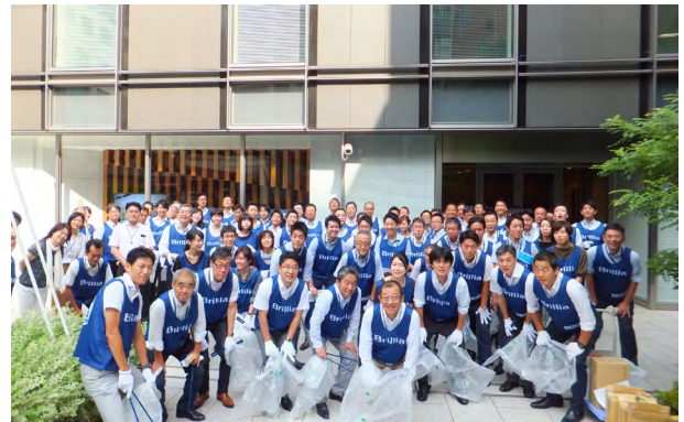
Morning Cleaning Activities

Even in the future, we want to contribute to the beautification of the city as a member of the local community.