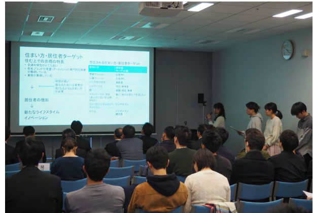
8th Presentation Session (Dec. 11, 2017)

Tokyo Tatemono plans, operates, and holds this seminar with the Institute of Sustainable City Forum.