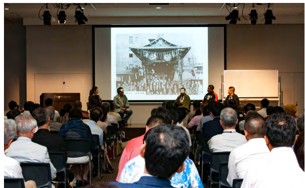
Edo Machi Jyuku

The Edo Machi Jyuku is a program to learn various things from the history to the way of shouldering the Mikoshi to more fully enjoy the Sanno Festival, which is one of the three largest festivals in Japan. Tokyo Tatemono is supporting local town councils and other associations as a secretariat that conducts planning and operations. We broadly recruit participants from inside and outside of the company and invite people with a deep relationship to the Sanno Festival as lecturers to talk about how to enjoy the Sanno Festival from many different perspectives. These activities became an opportunity for not only the local residents but also office workers to learn more deeply about the history and culture of the region, and we hope at least one more member of the town will pass down the culture.