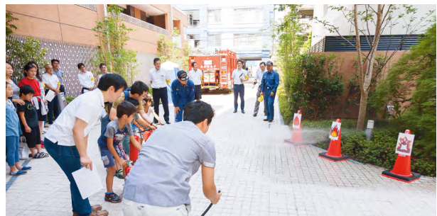
Disaster Prevention Training at Brillia Bunkyo Edogawabashi

A healthy community has a positive effect on maintenance and management of condominiums and leads to greater asset value. The Tokyo Tatemono Group makes proposals to management associations of condominiums about events for community building and support for their management. We conduct activities to cultivate communities in cooperation with management associations from social events before residents move in to community events perfect for each season after moving in (Christmas, Tanabata, etc.), fire-fighting drills, gardening, and support of operations for club activities.