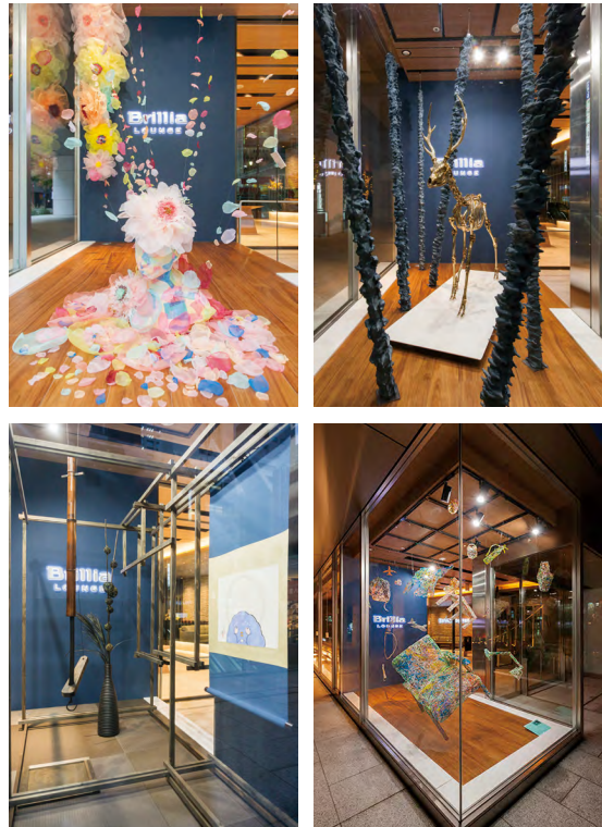
Works by Artists Introduced in 2017

For more information about THE GALLERY in Brillia Lounge, see: www.brillia.com/brillia/topics/ (Available in Japanese Only)