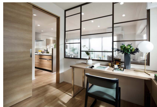
Brillia Tsurumaki Bloomoi Library

We reflected the results of this survey during the planning for Brillia Tsurumaki and equipped the condominiums with wireless LAN as a standard option in addition to arranging a Bloomoi Library central to the living space to fully support work-style innovation. This plan created an environment conducive to concentration with sliding doors while providing a view of the living space through glass. We also provided a sleek, smooth flow to and from bathrooms and kitchens.