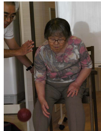
Day Service Members Enjoying Boccia

Grapes Tateishi has introduced Boccia as a recreational activity in its day services to take advantage of these features of the sport. The rules have even been arranged to provide a more welcoming experience with competitions verses other day service members or day service members versus the staff. Many people were unfamiliar with the sport of Boccia, but everyone was able to have fun thanks to the lack of vigorous movement and simple rules whether a person in a wheelchair or someone suffering from dementia. New challenges provide stimulation. We saw people who are generally pretty quiet open up and communicate while playing Boccia. The balls used in Boccia are also easy for people lacking grip strength to hold, which makes them perfect for various other recreational activities in the day service.