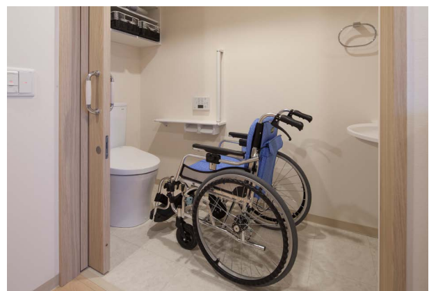
Suitable for Life in a Wheelchair

the one room units common to elderly residences, various room types up to a 2LDK are available depending on the property to provide a unique life suitable for each resident. Furthermore, the living environment has been built for the ease of use by elderly people, such as the height settings for switches and other equipment and the adoption of easy-to-clean materials and dimensions.