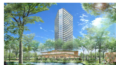
Conceptual drawing of completed (tentative) Kita-Aoyama 3-chome District Redevelopment Private Venture Project

(Tentative) Kita-Aoyama 3-chome District Redevelopment Private Venture Project currently in development on the former Toei Aoyama Kitamachi Apartment grounds in Kita-Aoyama, Minato Ward, Tokyo began construction in March 2018 (joint venture). This project has taken the form of a mixed land area in the heart of the district by developing the lots created privately in stages through rebuilding of the decrepit Aoyama Kitamachi Apartments. We earned an approximately 70-year fixed term lease to the site to establish rental apartments, senior residences that include services, and shops which respond to a wide range of lifestyles. We also will create a roughly 3,500 m 2 forest area (green space) to revitalize the rich nature essential to Aoyama.