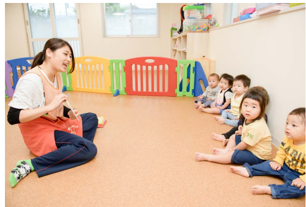
Kindergarten Building Children Spend Time Comfortably with Facilities and Specifications that Set Safety as the Top Priority

Based on the childcare philosophy to nurture abilities to live fully, we prepare an environment where children think for themselves and independently work at things.